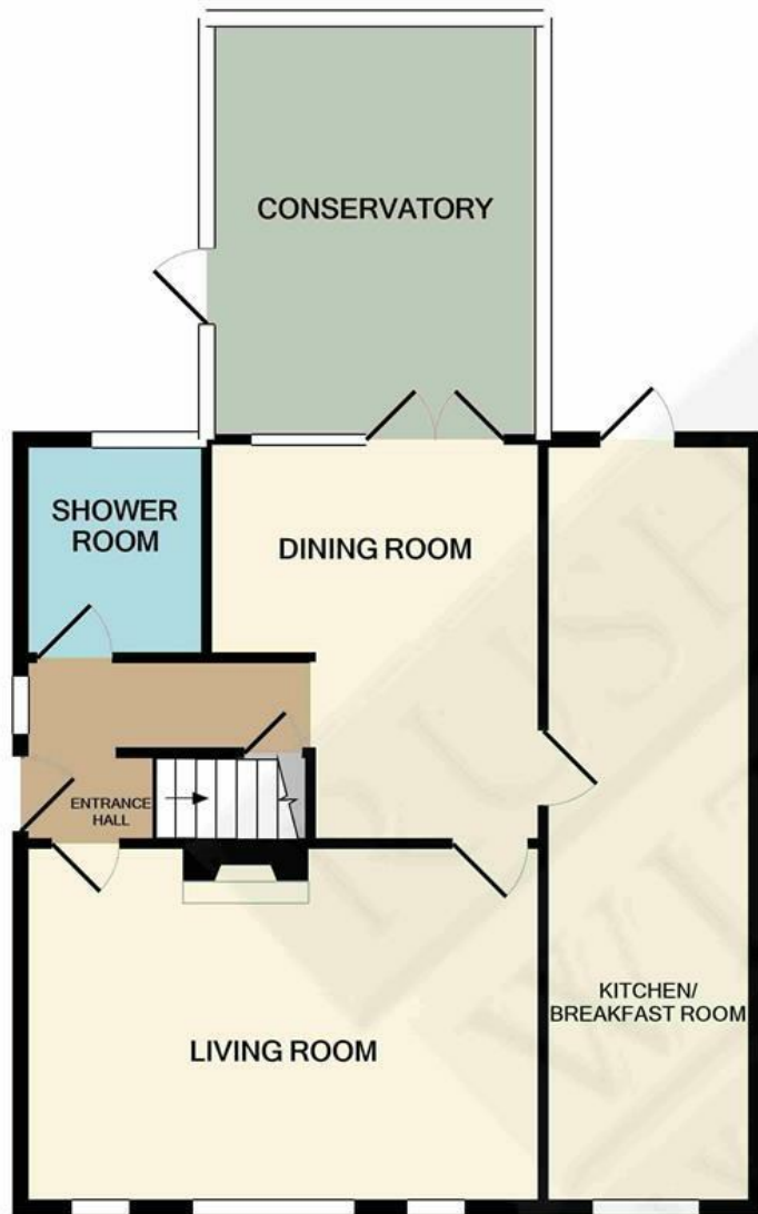
GROUND FLOOR APPROX. FLOOR AREA 651 SQ.FT. (60.5 SQ.M.)