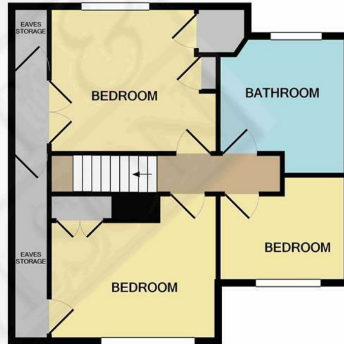
1ST FLOOR APPROX. FLOOR AREA 445 SQ.FT. (41.3 SQ.M.)

TOTAL APPROX. FLOOR AREA 1096 SQ.FT. (101.8 SQ.M.)